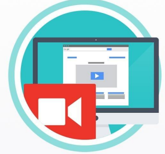
Content Builder Tool INR 4,335/-