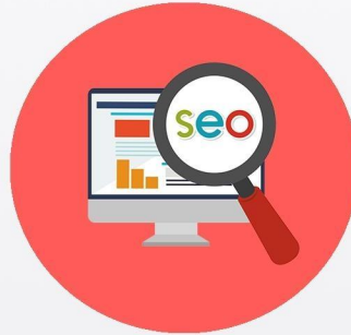
SEO Software INR 13,200/-