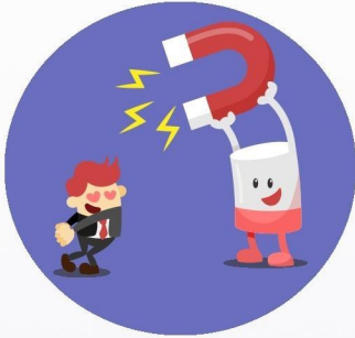
Lead Capture Plugin INR 4,335/-

Get Tools & Softwares Worth INR 83,624/- Absolutely Free