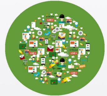
Other Important Tool INR 48,956/-