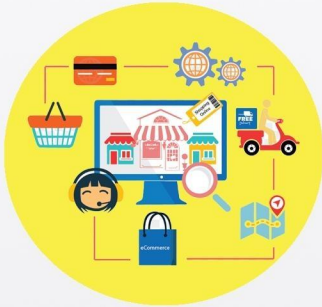
E-commerce Website Tool INR 3,999/-